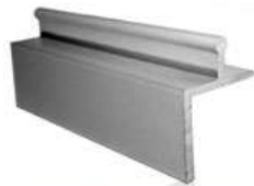
Aluminum Base Channel (3/4" x 3/4")